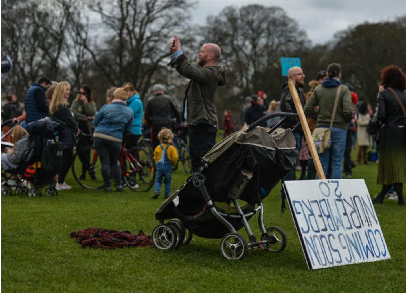
Manifestation anticonfinement dans Phoenix Park, à Dublin (Irlande), le 20 mars 2021.

En Irlande, où le port du masque n'est obligatoire que dans les lieux publics clos, la part des malades du Covid-19 contaminés en extérieur est infime, selon les données communiquées par les autorités sanitaires à The Irish Times .